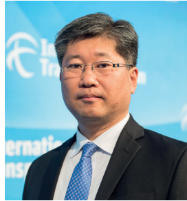
YOUNG TAE KIM ITF Secretary-General

On a broader front, many cities are investigating shared mobility solutions that make better use of the capacity of vehicles. Private cars are only used 50 minutes out of 24 hours on average, and then carry only 1.2 to 1.4 passengers. Digital technology offers the possibility to match demand for travel with supply of rides to move more people with fewer vehicles. Cars would do what they were made for, rather than be mostly idle in our streets and front yards.