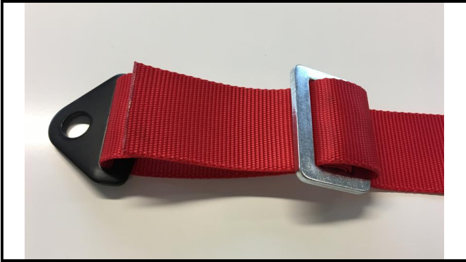
A1-1) Position / Position : left shoulder strap