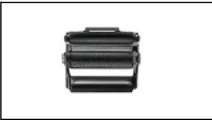
A2-3) Position / Position : left and right lap strap