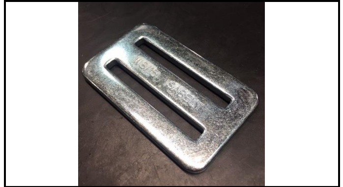
A2-2) Position / Position : left and right Shoulder body top straps