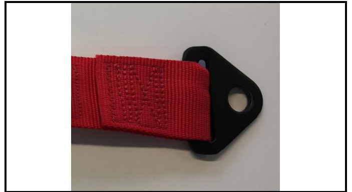
A1-4) Position / Position : right lap strap