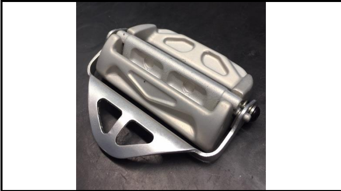
A2-1) Position / Position : left and right shoulder body strap