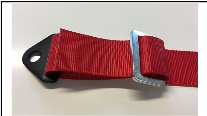
A1-5) Position / Position : left crotch strap