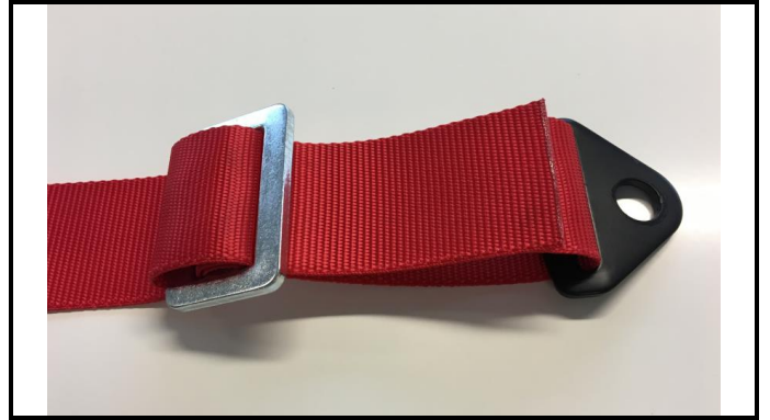
A1-2) Position / Position : right shoulder strap