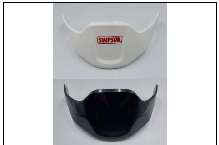
E4) Adjustable Peak