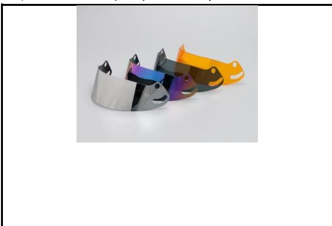
E5) isor Sunshield (short) closed cockpit car