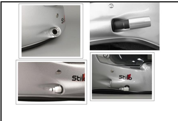
E3) Side port components (examples)