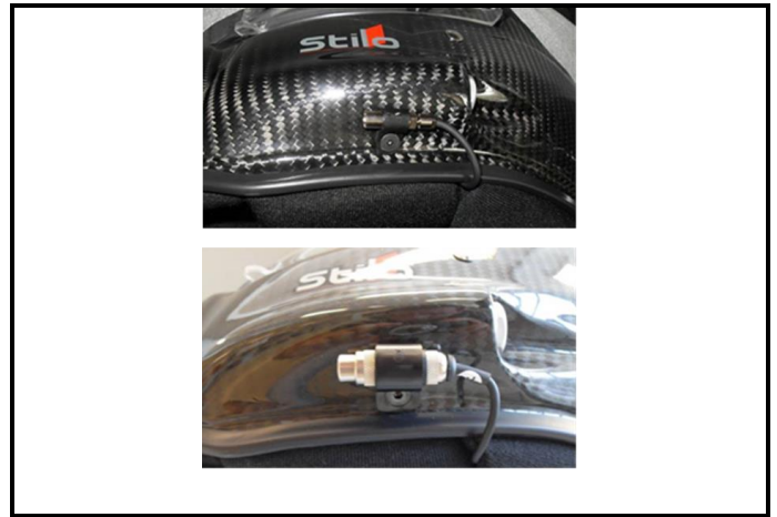
E2) Clip earplugs connector