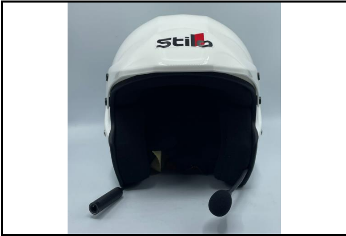
D1) Vue de face / Front view