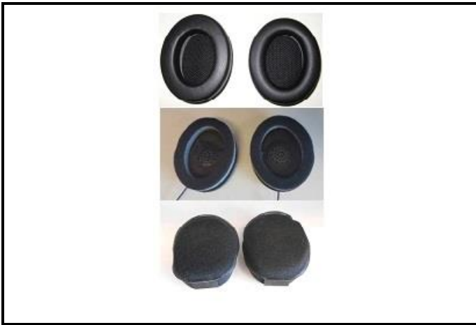
E1) EAR CUPS Stilo TYPE WRC YA0002/EAR PADS