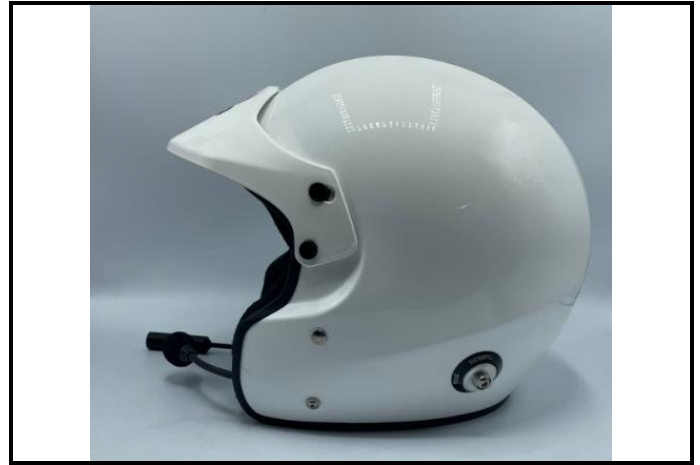
D2) Vue du Côté Droite / Right Side view