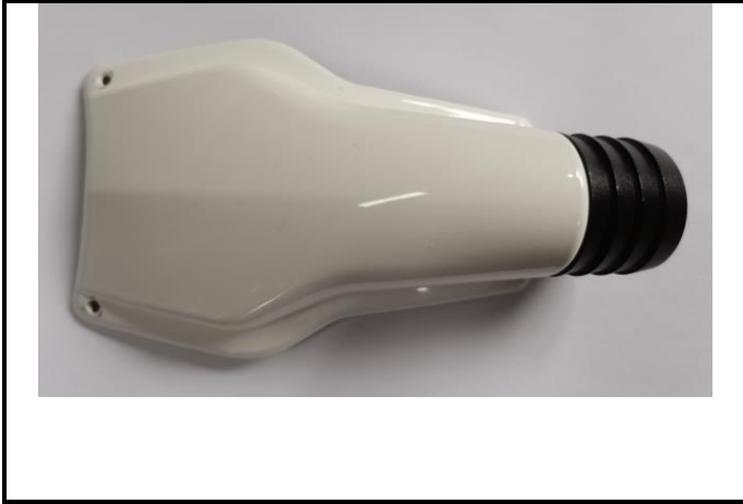
E1) TOP AIR FORCED