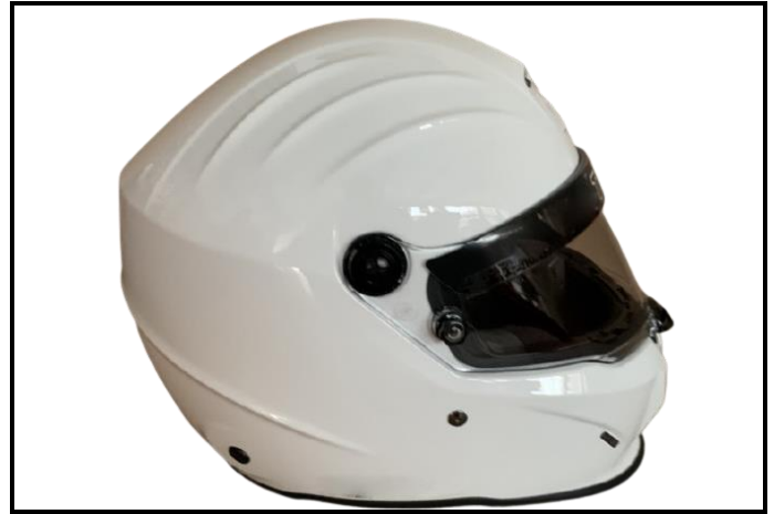
D2) Vue du Côté Droite / Right Side view