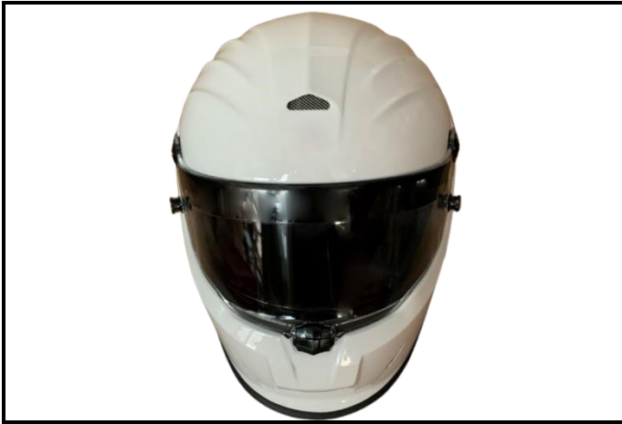
D1) Vue de face / Front view