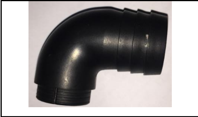
E7) H1CAV FORCED AIR NOZZLE V.05 ( 90 DEGREES )