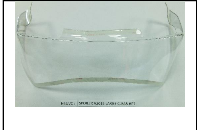
E4) H4UVC SPOILER V15 LARGE CLEAR HP7