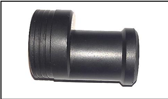
E9) H3MXX FORCED AIR NOZZLE QUICK LOCK V.10