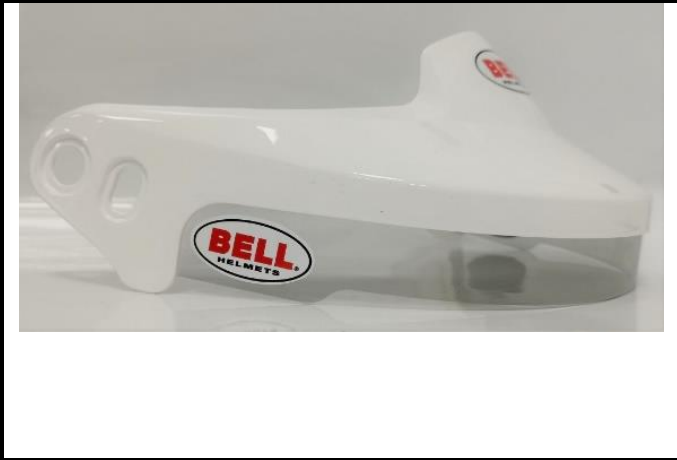
E1) H3XHQ GT5 peak with sunscean