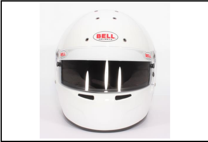
D1) Vue de face / Front view