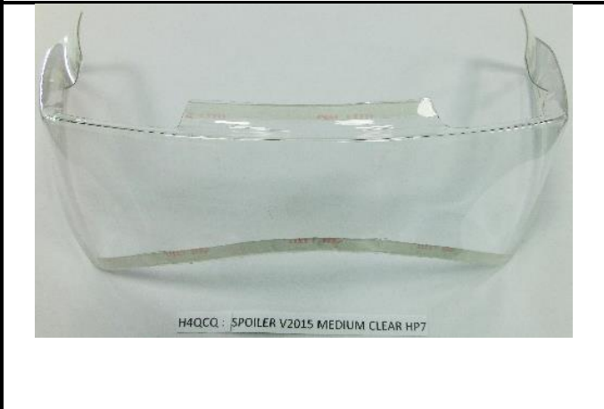
E3) H4QCQ SPOILER V15 MEDIUM CLEAR HP7