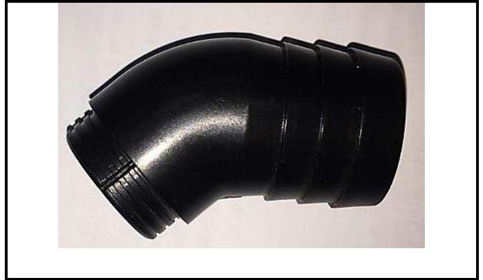
E8) H1DUQ FORCED AIR NOZZLE V.05 ( 45 DEGREES )