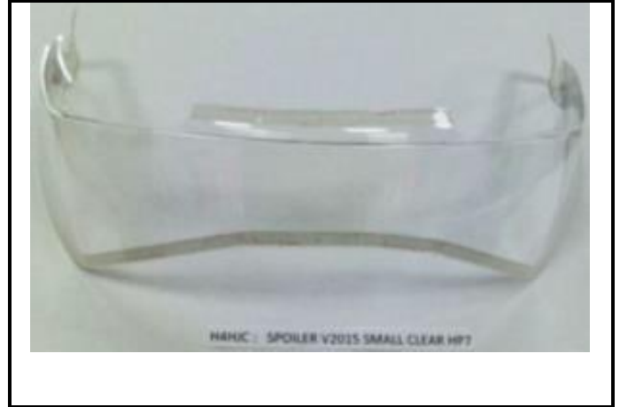
E2) H4HJC SPOILER V15 SMALL CLEAR HP7