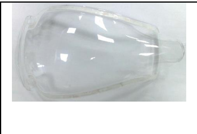
E5) H4AJY FORCED AIR TOP EYEPORT(CLEAR) - HP7/HP5