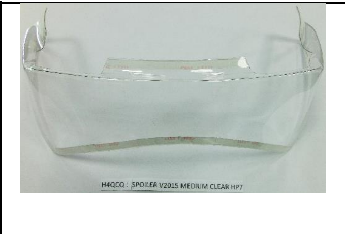
E3) H4QCQ SPOILER V15 MEDIUM CLEAR HP7