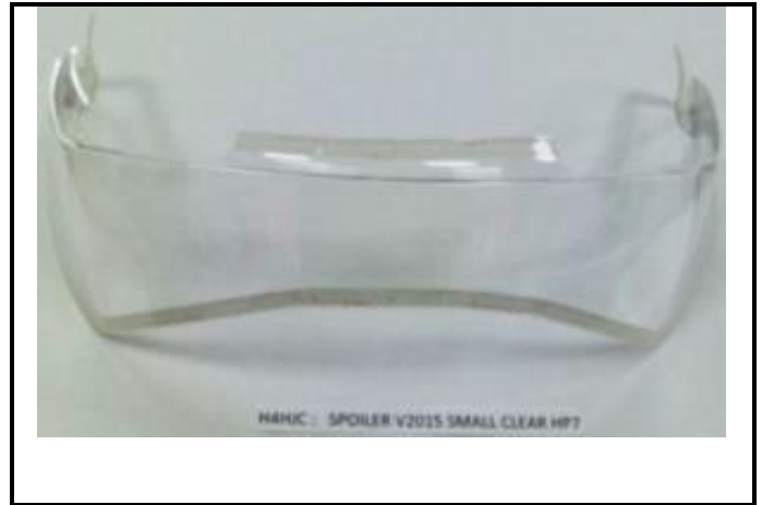
E2) H4HJC SPOILER V15 SMALL CLEAR HP7