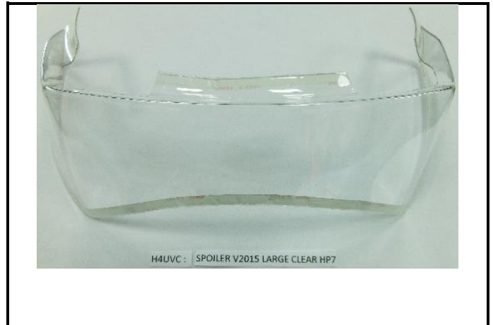
E4) H4UVC SPOILER V15 LARGE CLEAR HP7