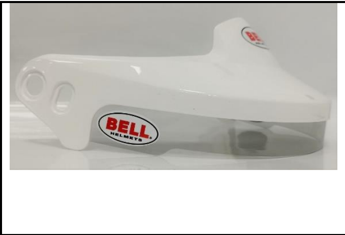
E1) H3XHQ GT5 peak with sunscean