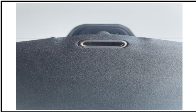
A1-3) Position / Position : FRONT BAND LOOP