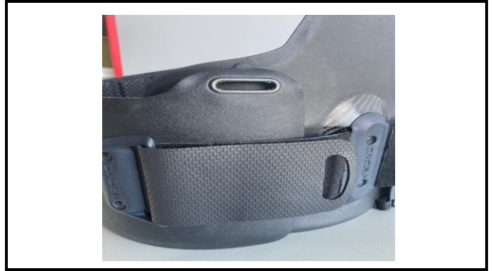
A1-2) Position / Position : EYELET OF SHOULDER STRAP