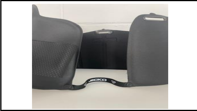
A1-1) Position / Position : STRING