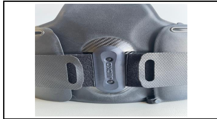
A1-4) Position / Position : SHIELD BAND STOPPER