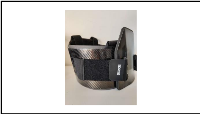
A1-3) Position / Position : minimum closure on the right side