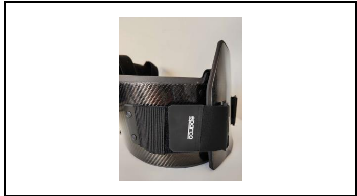
A1-4) Position / Position : maximum closure on the right side