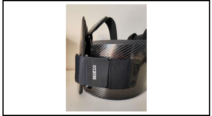
A1-2) Position / Position : maximum closure on the left side