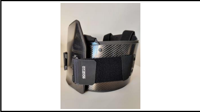
A1-1) Position / Position : minimum closure on the left side