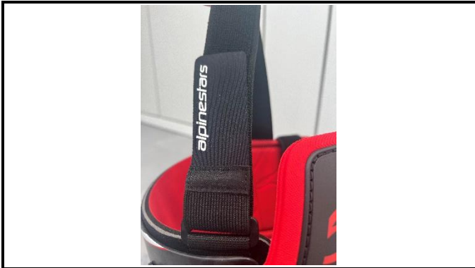
A1-5) Position / Position :