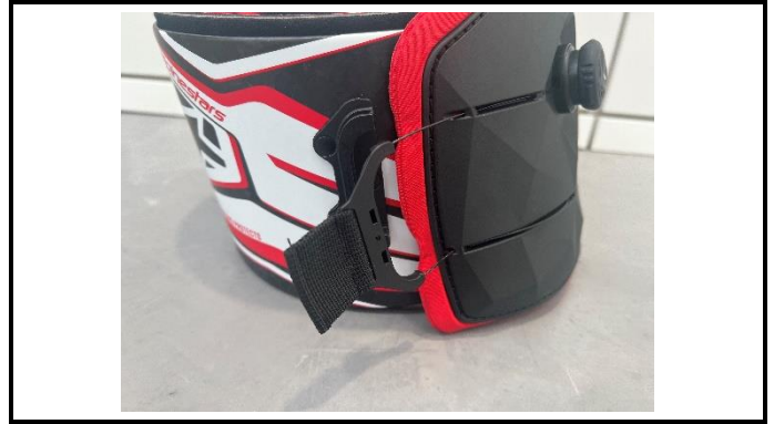
A1-2) Position / Position :