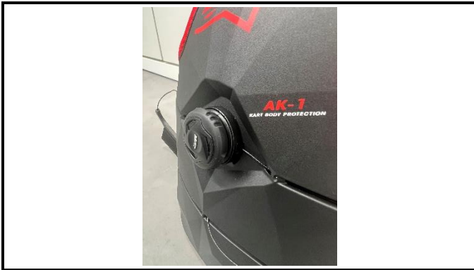
A1-3) Position / Position :