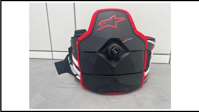
A1-1) Position / Position :