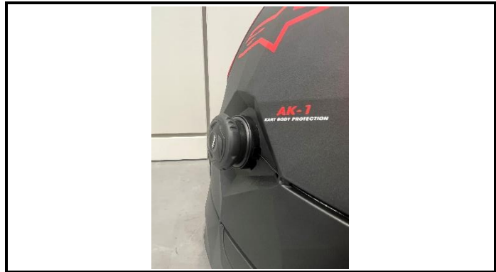
A1-4) Position / Position :