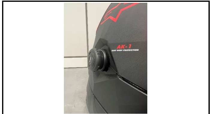
A1-4) Position / Position :