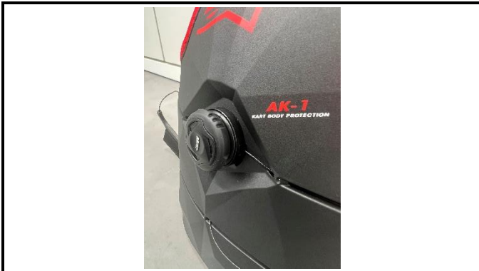
A1-3) Position / Position :