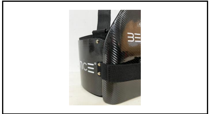
A1-4) Position / Position : CORRECT CLOSING POSITION