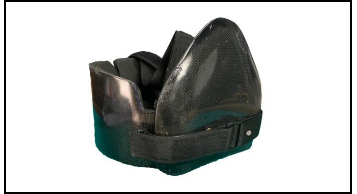
A1-2) Position / Position : CLOSED POSITION