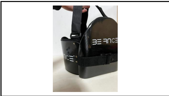
A1-5) Position / Position : FRONT POSITION DURING USE