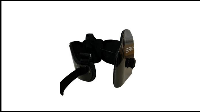
A1-1) Position / Position : OPENED POSITION