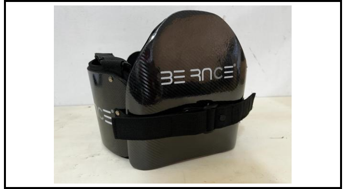
A1-2) Position / Position : CLOSED