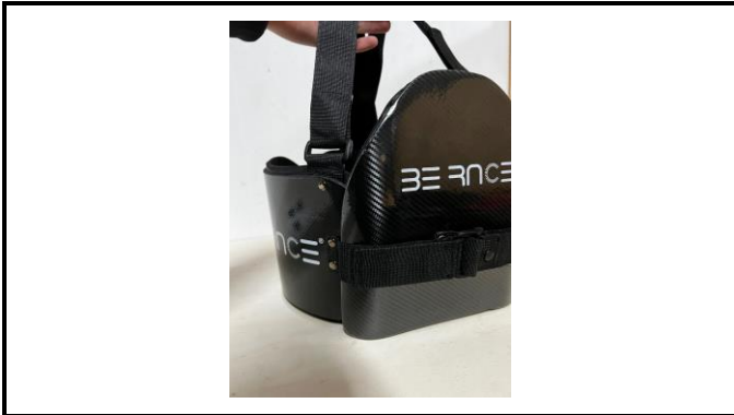
A1-5) Position / Position : FRONT POSITION DURING USE