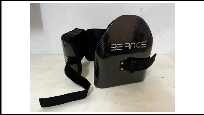
A1-1) Position / Position : OPENED