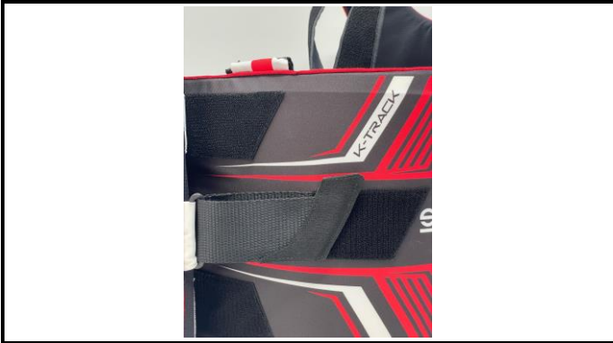
A1-1) Position / Position : minimum closure on the left side