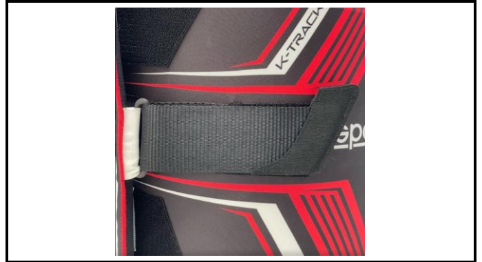
A1-2) Position / Position : maximum closure on the left side