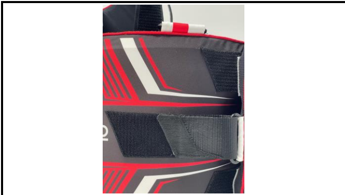
A1-3) Position / Position : minimum closure on the right side