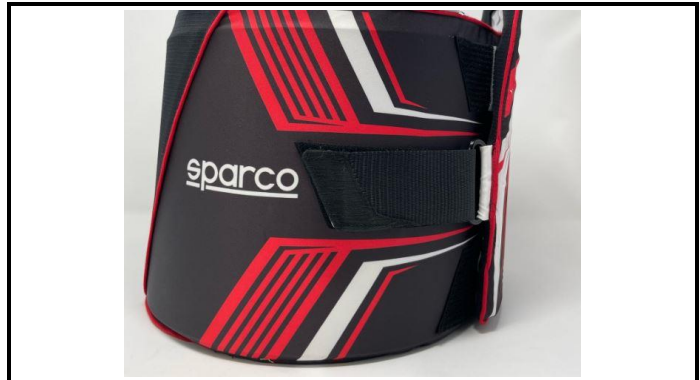
A1-4) Position / Position : maximum closure on the right side