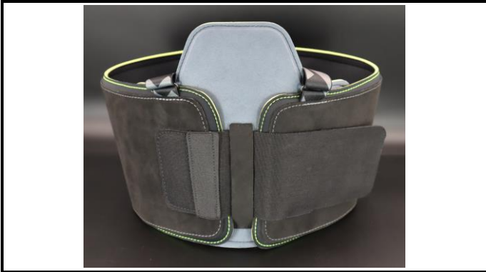
A1-1) Position / Position : Showing minimum front adjustment