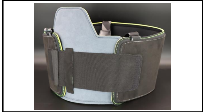
A1-2) Position / Position : Showing maximum front adjustment