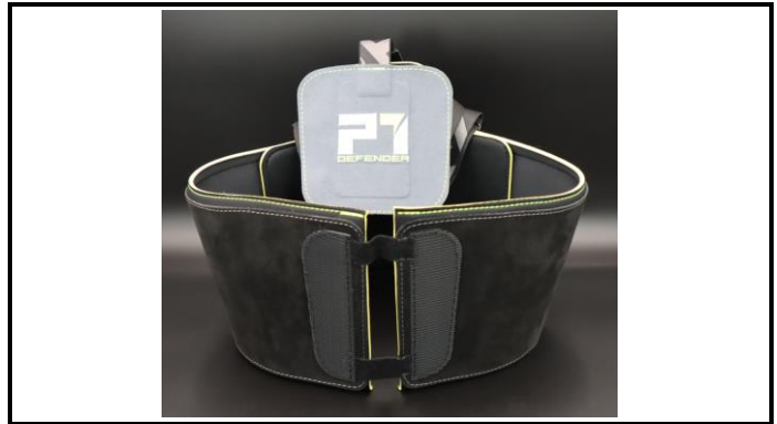
A1-4) Position / Position : Showing maximum rear adjustment