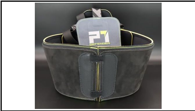
A1-3) Position / Position : Showing minimum rear adjustment