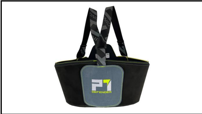
A1-5) Position / Position : Showing angle fixing panel in position