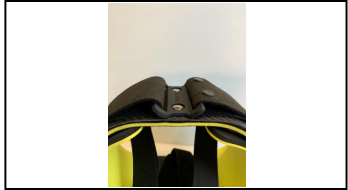
A1-4) Position / Position : FRONT BUTTERFLY