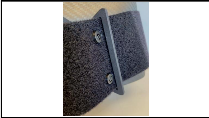
A1-5) Position / Position : STUDS