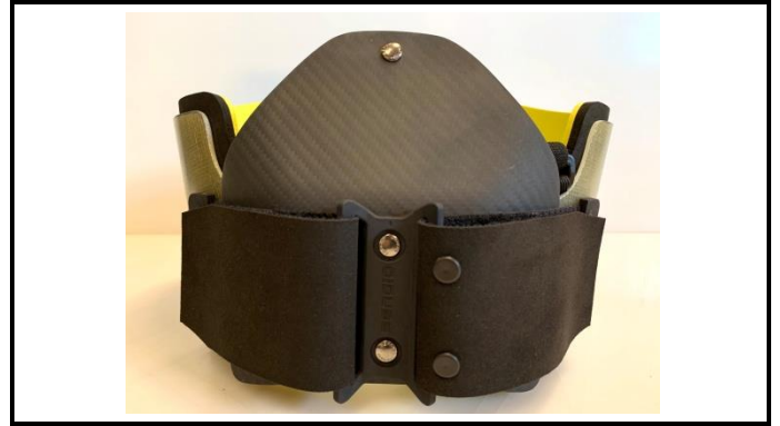
A1-2) Position / Position : FRONT CLOSURE