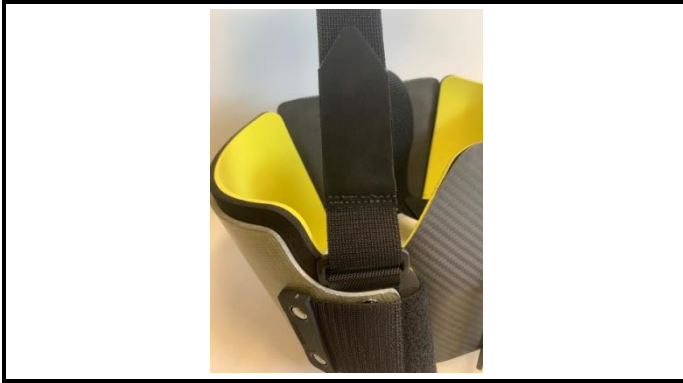
A1-1) Position / Position : SHOULDER STRAP