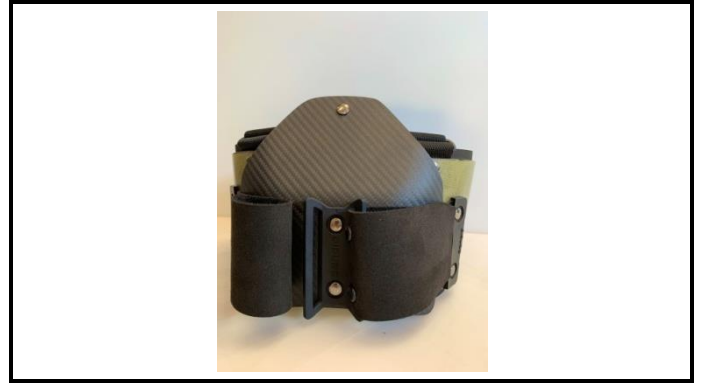
A1-2) Position / Position : FRONT CLOSURE