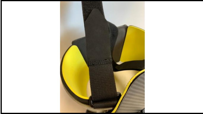
A1-1) Position / Position : SHOULDER STAP