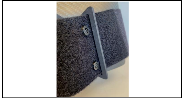
A1-4) Position / Position : STUDS