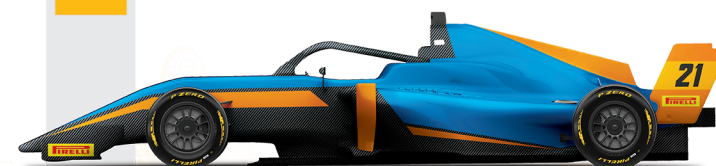
Jett Bowling (USA)