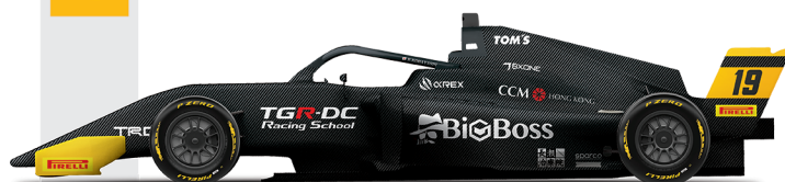
Rikuto Kobayashi (JPN)