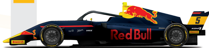
Enzo Deligny (FRA)