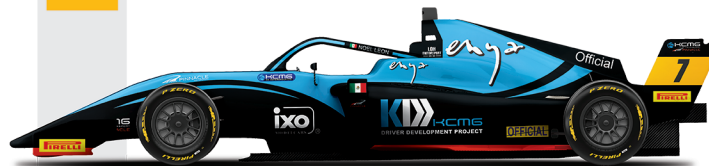
Noel Leon (MEX)