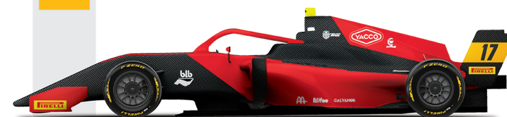
Evan Giltaire (FRA)