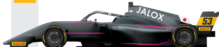
Sota Ogawa (JPN)