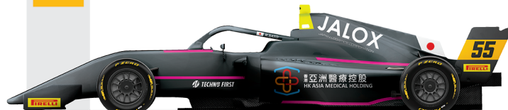
Rintaro Sato (JPN)