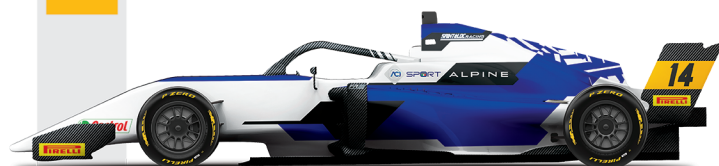
Théophile Nael (FRA)