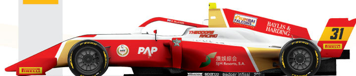
Freddie Slater (GBR)