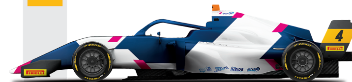
Ugo Ugochukwu (USA)