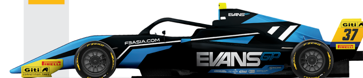
Cooper Webster (AUS)