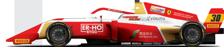
Dino Beganovic (SWE)